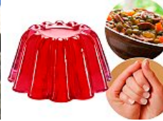
Want to avoid winter colds? Tuck into