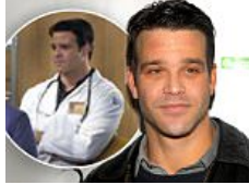
Soap star Nathaniel Marston 'will most