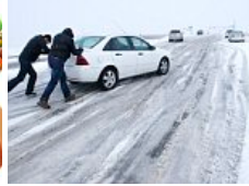
Fast-moving storm dumps snow on