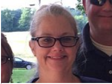
Seven executives from a Florida real