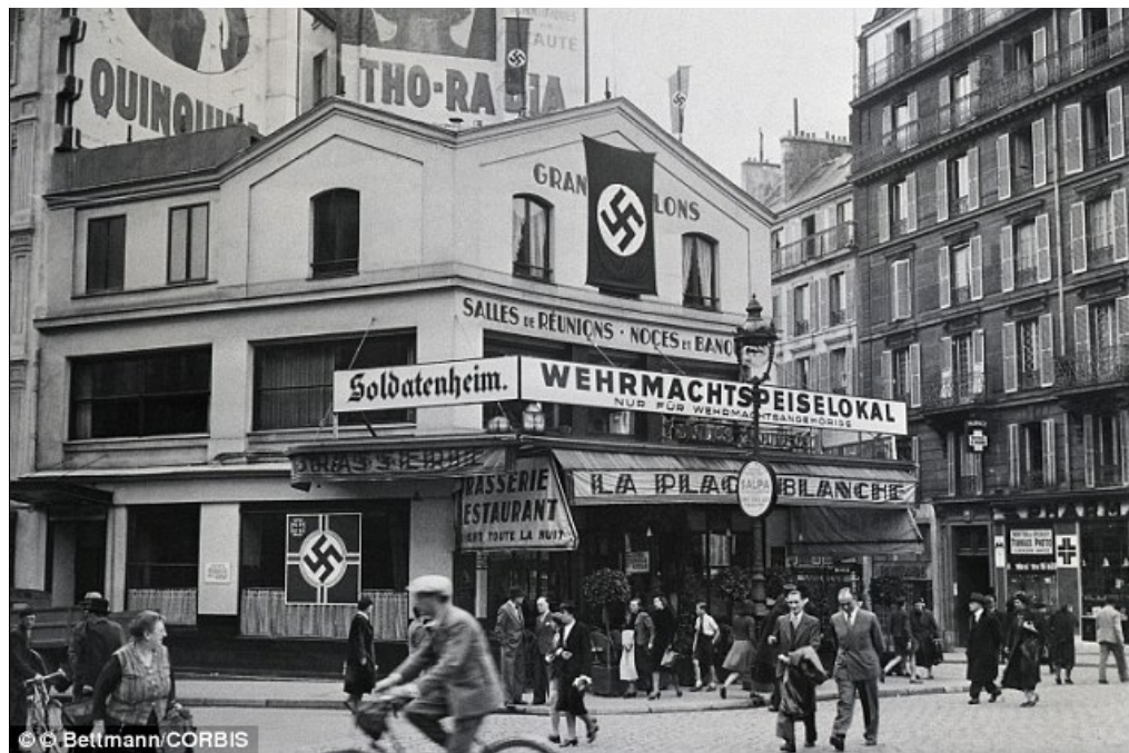
Paris pictured in 1940 after it was seized by Nazi forces following a rapid attack from Germany

After so much Aryan merry-making, Siegfried Park has a lonely, forlorn feel today. The parade ground, where aspiring stormtroopers would march up and down past giant banners of the U.S. and Nazi Germany, still remains. The old clubhouse, once festooned in swastika flags, is gone.