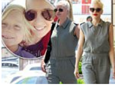
EXCLUSIVE: Posing with Zuma, upswept