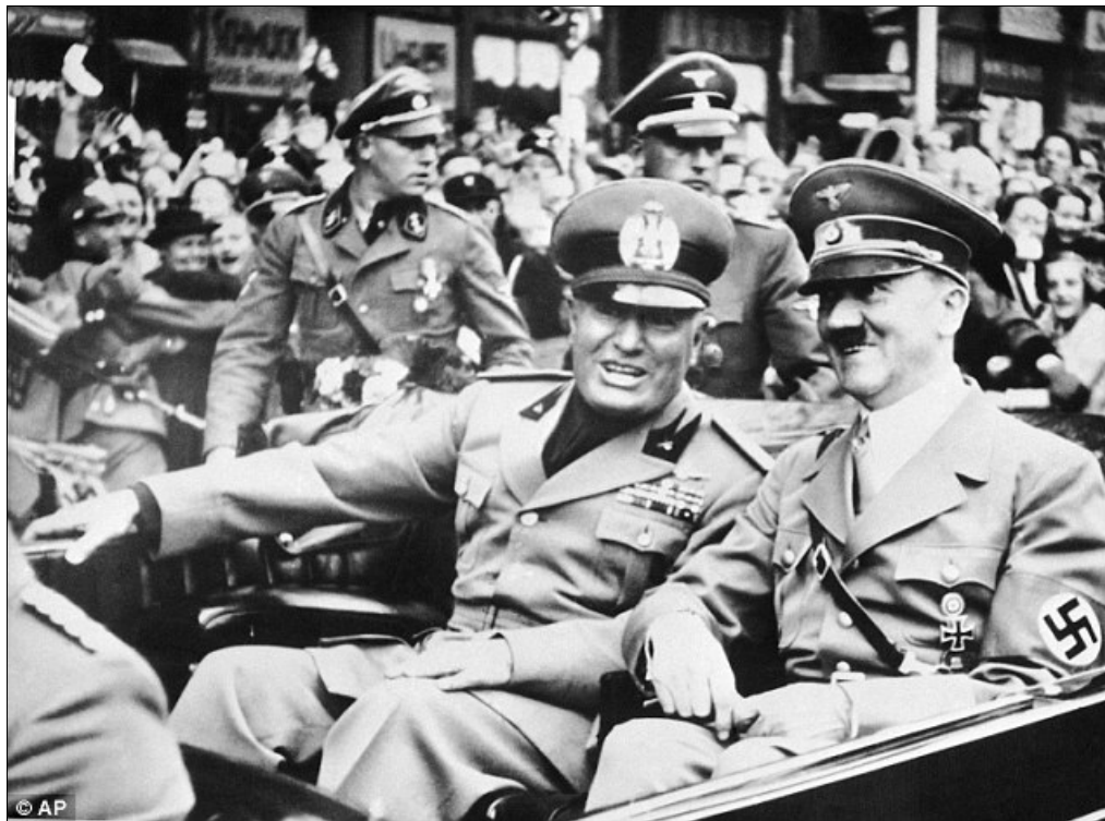
After World War II broke out, the U.S. government seized the land, but its owner, a community organisation called the German-American Settlement League (GASL), later managed to wrestle back control of much of the site