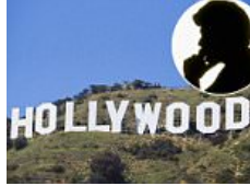
Rumors sweep Hollywood that male