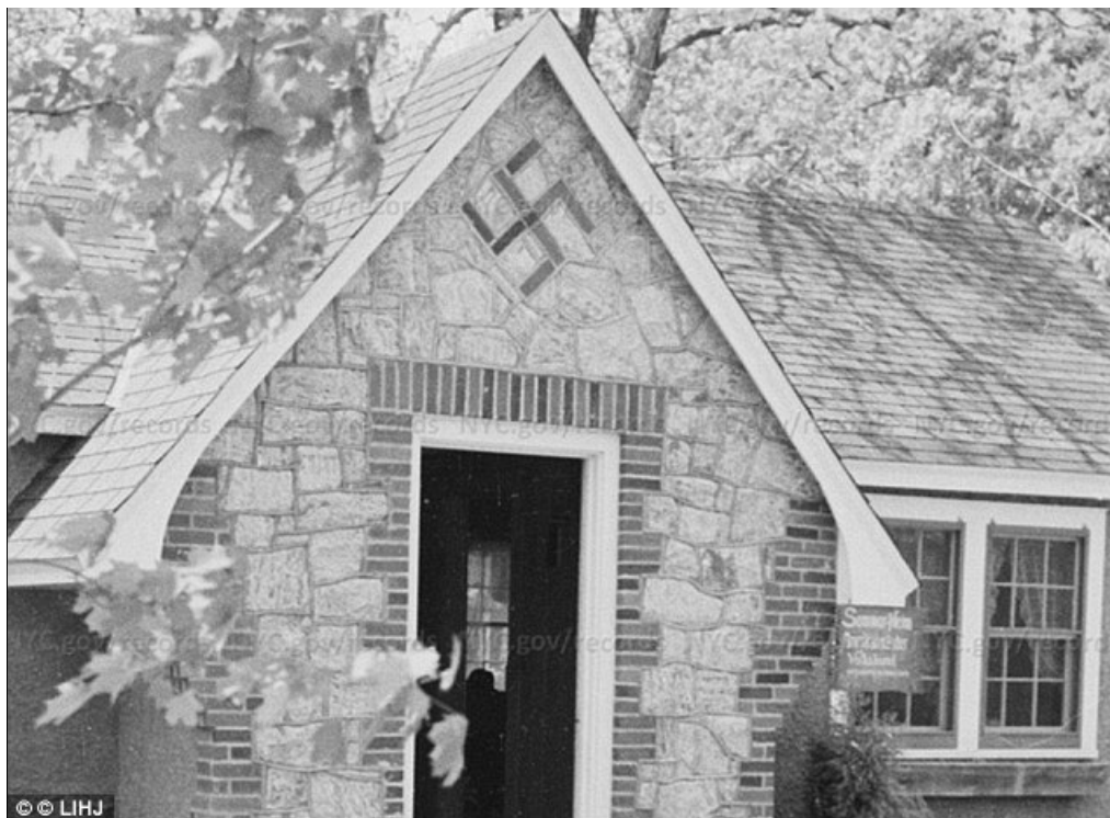
There is no sign left of Adolf Hitler Street, nor Goebbels Street or Goering Street. The swastika-shaped garden hedge and swastika stonework above a residential front door have also gone.