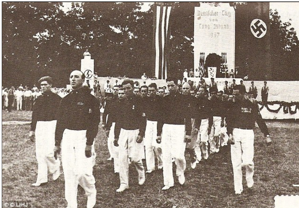
The neighbourhood of German Gardens was set up in the Thirties to house American Nazis, adults and children, who flocked in their hundreds to attend a summer camp, where they basked in the dubious delights of American-tinged National Socialism

The dystopian scenario of America's east coast being taken over by victorious Nazi Germans was famously imagined by Philip K. Dick in his 1962 novel The Man In The High Castle , which has now been turned into a TV series. For some Yaphank residents, the programme might feel a little too close to home.