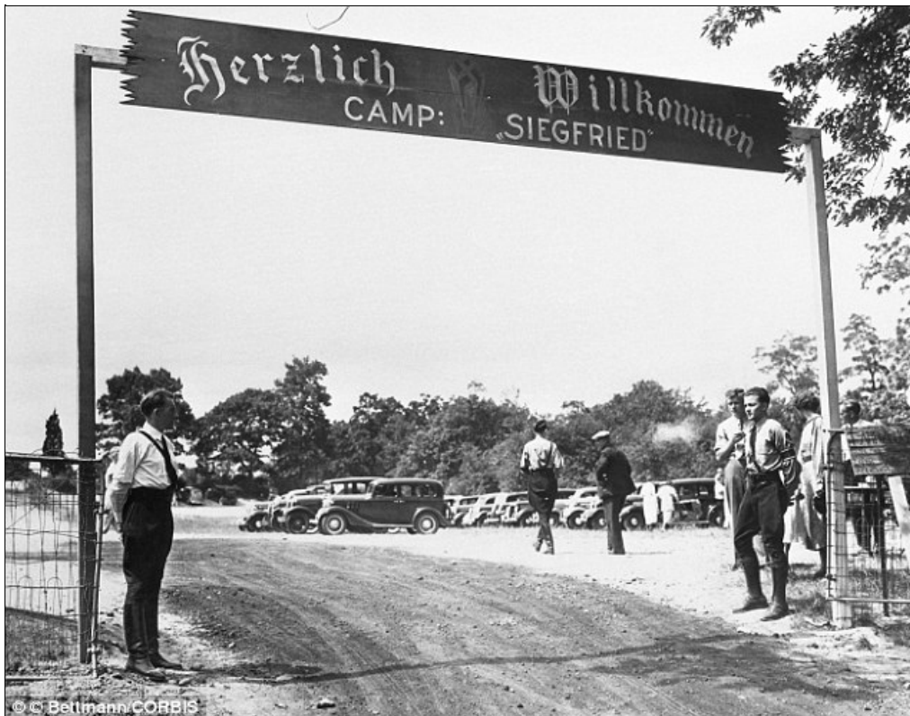
The neighbourhood of German Gardens was set up in the Thirties to house American Nazis, adults and children, who flocked in their hundreds to attend a summer camp, where they basked in the dubious delights of American-tinged National Socialism

In their court submission, the Kneers emphasise their point by including pictures from the Thirties of